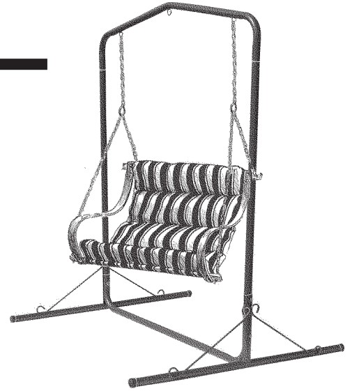
Steel Swing Stand shown with Double Cushioned Swing (Swing is sold separately.)

Tools needed to assemble your Steel Swing Stand: 2 Adjustable Wrenches